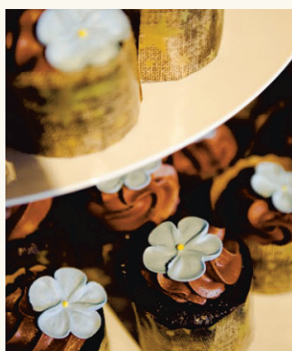
A tower of chocolate Merlot cupcakes by Amy Bakes Cupcakes.