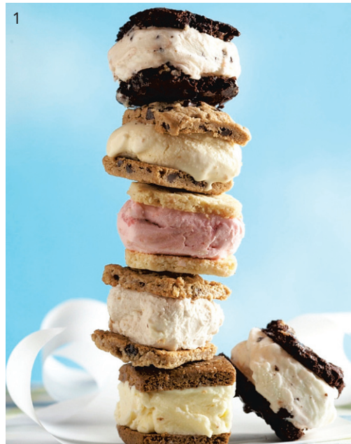
1. Coolhaus ice cream sandwiches come in myriad combinations of flavors. 2. Popular for dessert tables, Parisian macarons are French delicacies made with ground almonds. 3. This dessert table by Amy Atlas was inspired by the couple's wedding invitations' cherry blossom tree motif.

Some of Weiss' favorites include ice cream sundae bars provided by Van Nuys' Dandy Don's HomeMade Ice Cream, ice cream sandwich bars by